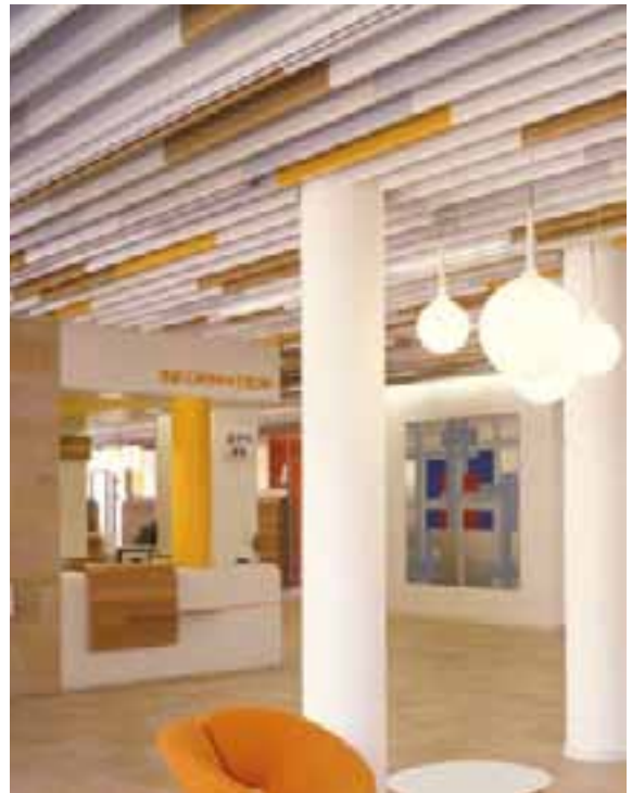
Volksbank Raiffeisenbank, Dachau

Our extensive knowledge, decades of experience and personal support enable your project to be carried out with special individual solutions just the way you want.