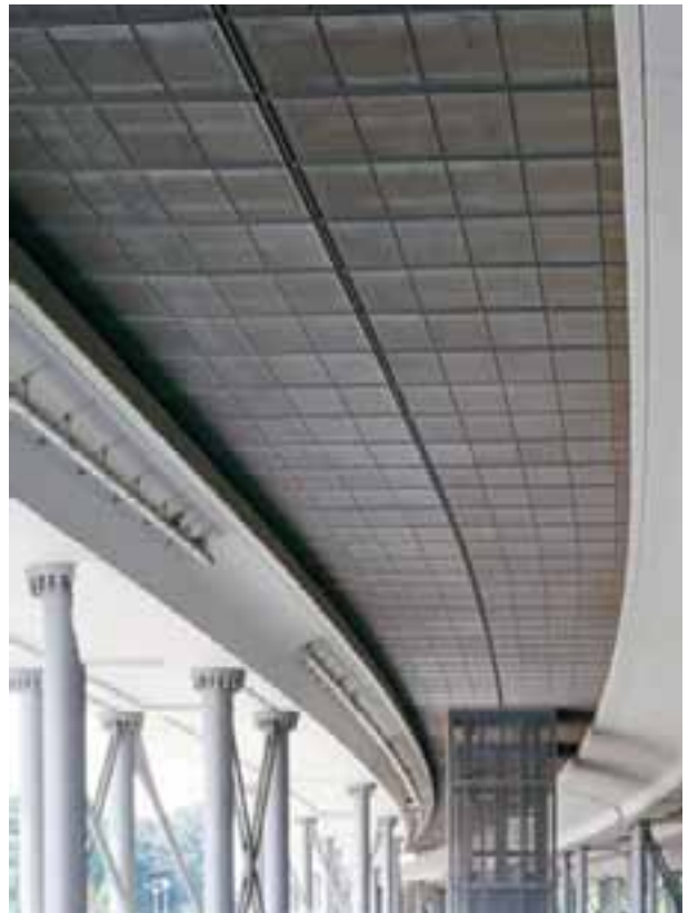
Hotel am Bahnhof, Innsbruck

Services we offer include quality control, logistics, warehousing and storage, financial and process control as well as aspects such as health and safety.