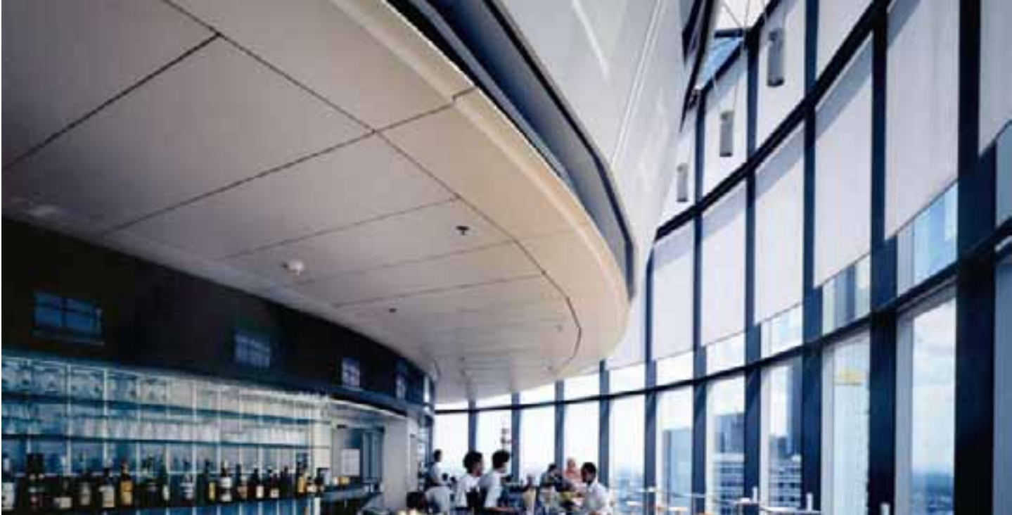
Main Tower, Frankfurt am Main