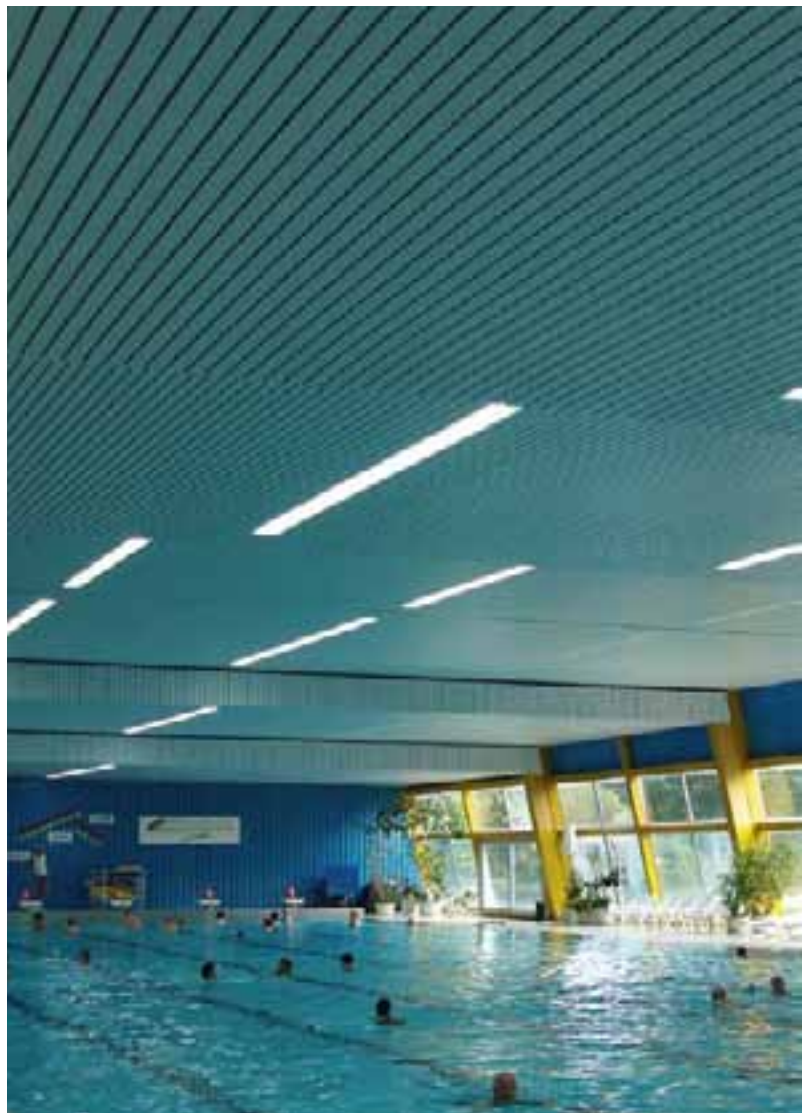
Water Park, Grünstadt