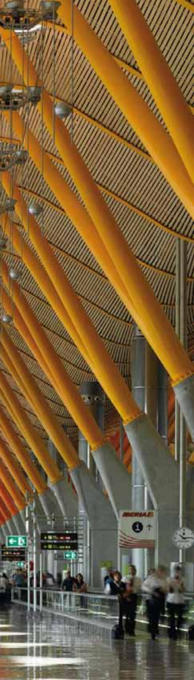
Madrid Barajas International Airport Architects: Rogers Stirk Harbour + Partners, Estudio Lamela