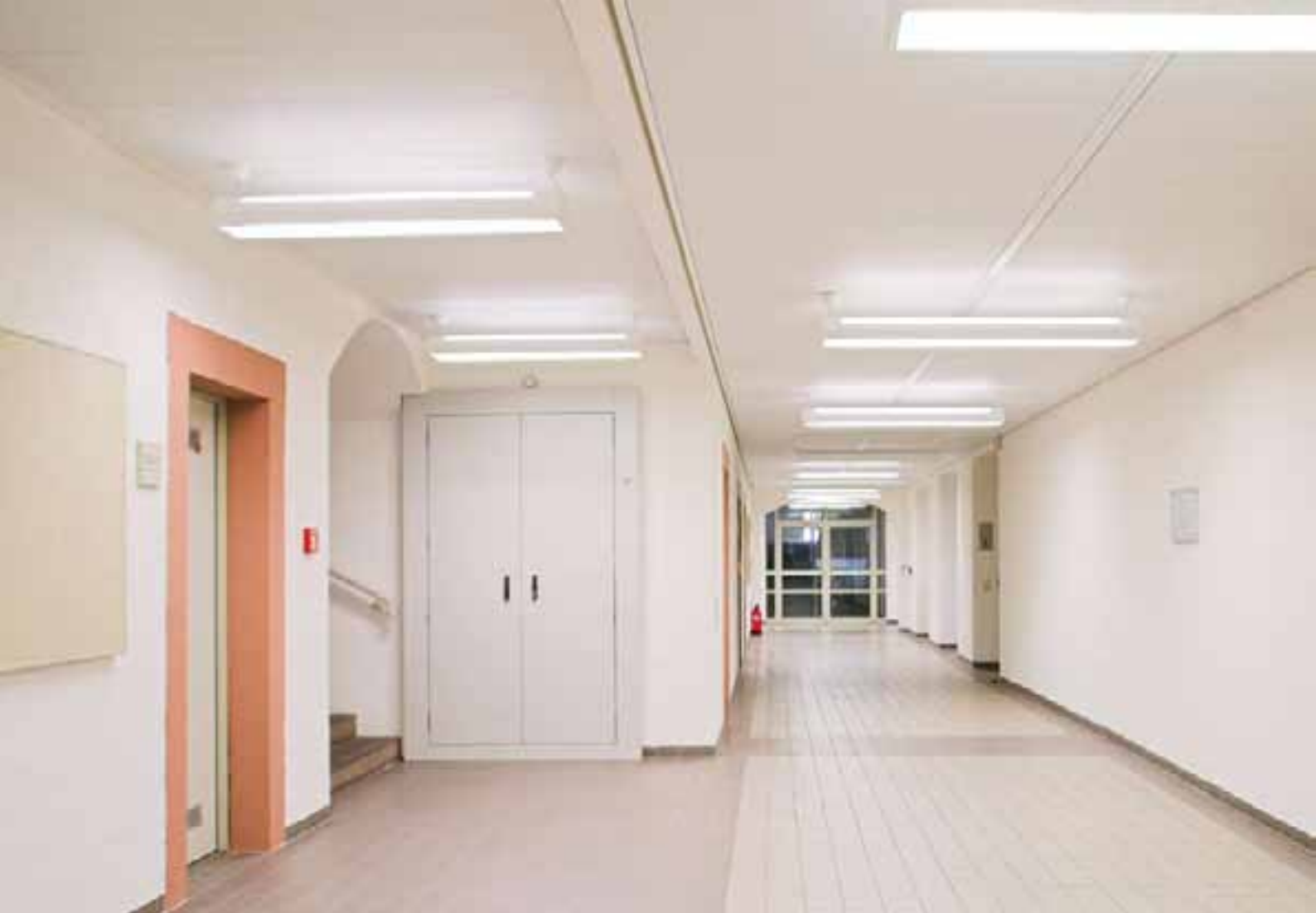
University of Karlsruhe