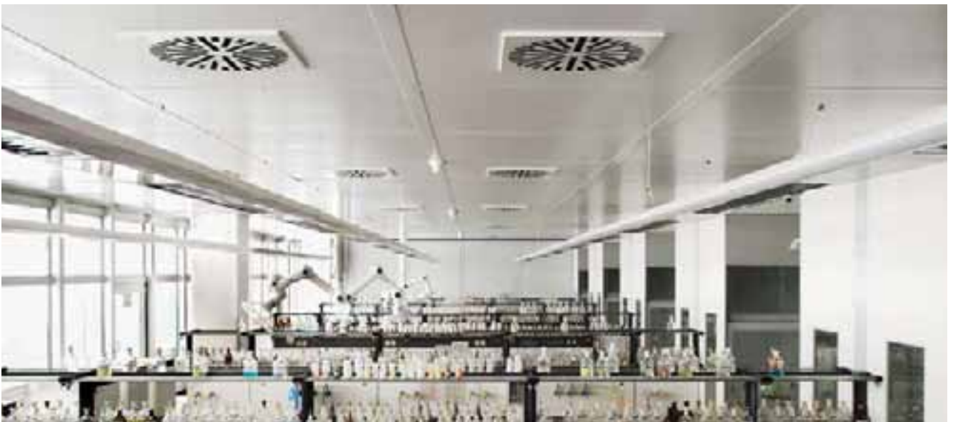
University of Hohenheim, Stuttgart

Our fire protection systems LMD F30/F90 fulfil the highest visual standards and can withstand extreme conditions.