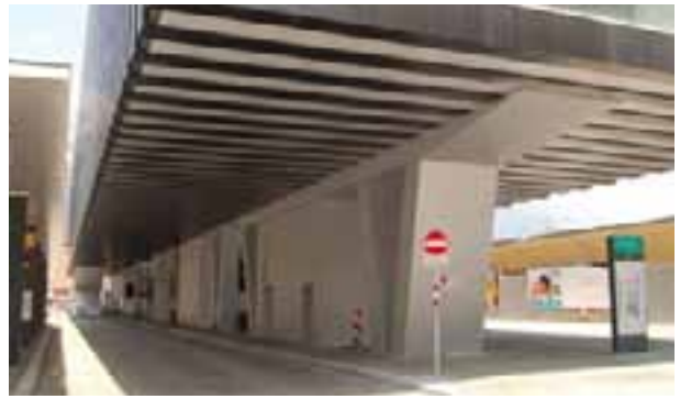
Hotel am Bahnhof, Innsbruck

Our integrated project management process ensures perfect installations – even in large international projects.