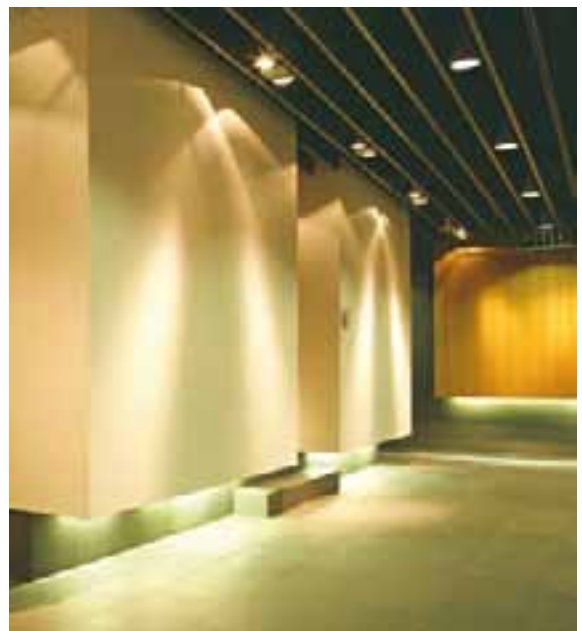
Lufthansa First Class Lounge, Frankfurt