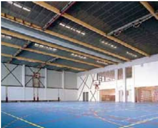
De @rchipel Bredeschool, Almeren

Whether diamond-shaped or square mesh, or an open cell or a closed panel system, our large range of mesh designs enables you to create a uniquely individual room.