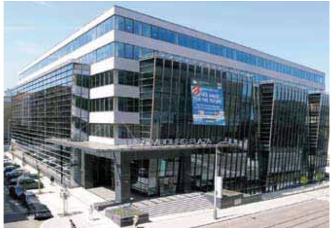
Luxembourg Plaza, Prague

Lindner manufactured and supplied the transparent ceiling canopy made of perforated steel.