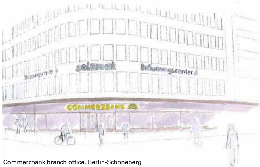
Commerzbank branch office, Berlin-Schöneberg

Lindner offers you overall national presence, our own capacities, short reaction times and partnership with a strong company for any building project: from small to large-scale projects.