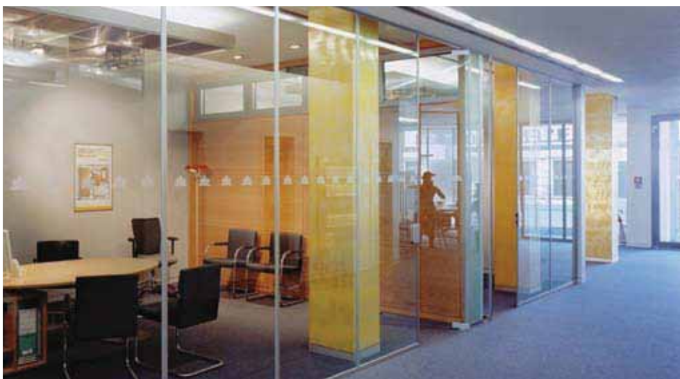
Commerzbank branch office, Berlin-Nord

Lindner offers you overall national presence, our own capacities, short reaction times and partnership with a strong company for any building project: from small to large-scale projects.