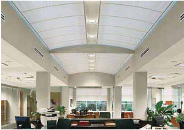
Bank of River Oaks, Houston/Texas (USA)

Lindner manufactured and supplied the transparent ceiling canopy made of perforated steel.