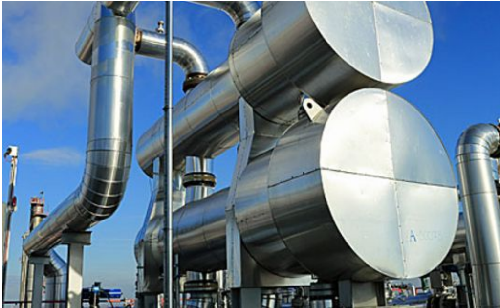
Completed Works: Industrial insulation