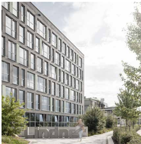
Headquarters of the Lindner Group in Arnstorf, Bavaria