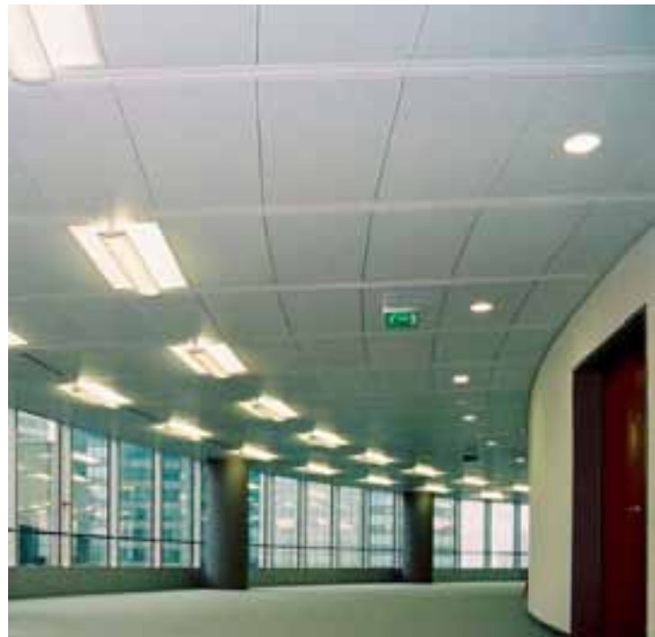
CBX Tower, Paris

The understated design achieved by integrated lighting is extremely suitable for an architectural lighting scheme. Versatile design means that integrated lighting can be co-ordinated perfectly with your ceiling module or flush-mounted without the need for additional joints, panels or coverings. Frameless lighting modules avoid colour variations on the ceiling. Take advantage of our pre-assembled components, which ensure that there are fewer interfaces and lower installation costs.