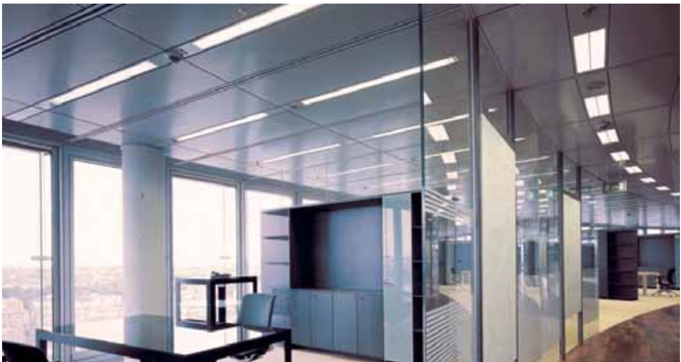
UNIQA Tower, Vienna

Aluminium mirror grid diffusers are highly efficient when it comes to lighting levels and glare control. Optional models for F30 and F90 ceiling elements (T38/20) are available.