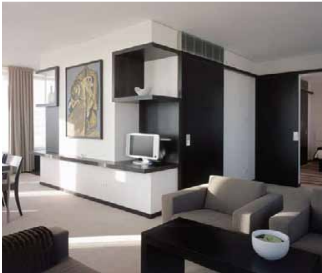
Hotel Concorde, Berlin

For this project, Lindner carried out the complete interior work as the general contractor. We provided all dry construction, natural stone and metal work, plus wood and textile floor coverings. Our main tasks were the entire joinery work and the fittings for all 311 rooms and suites including curtains and light fittings.