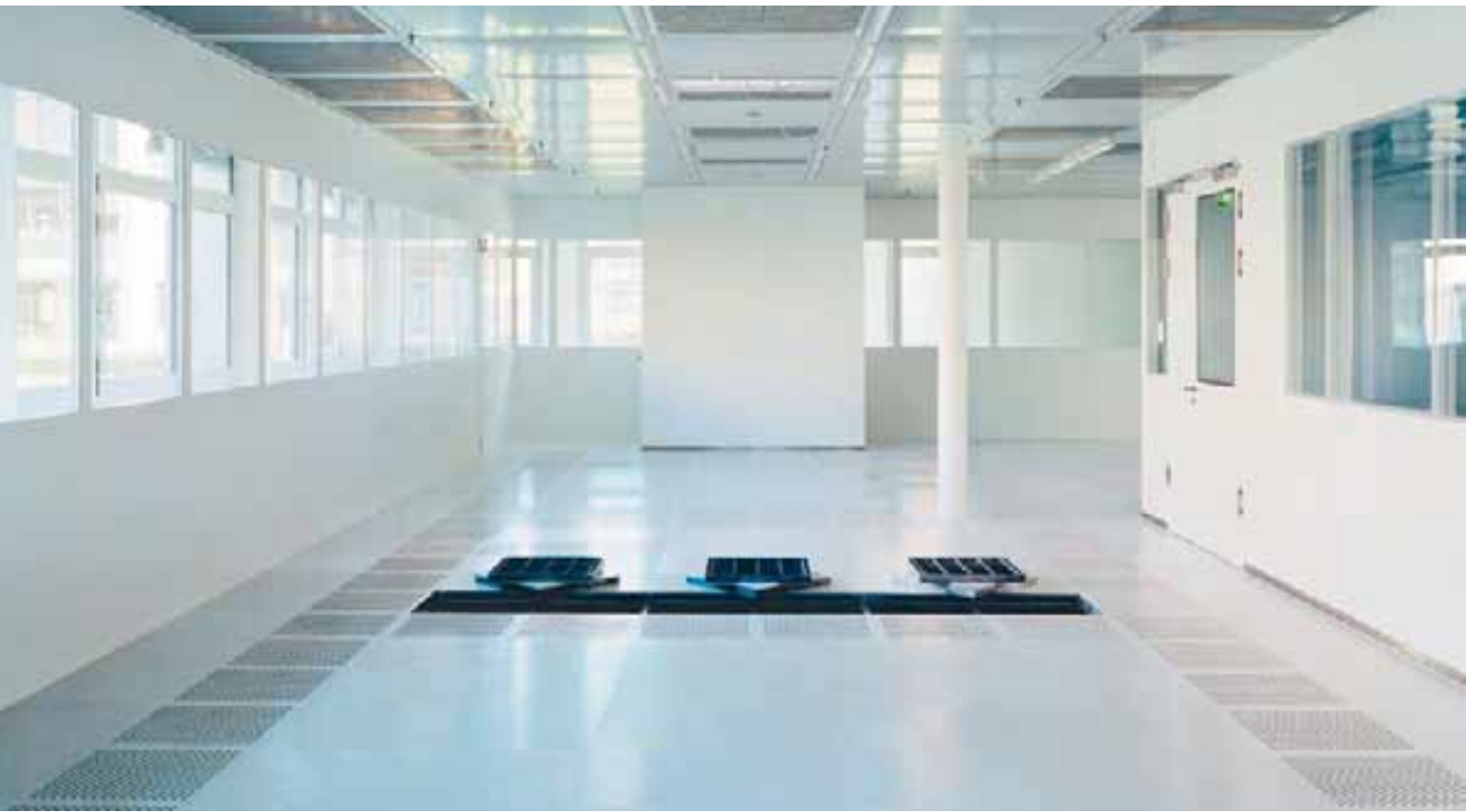
Infineon, Munich – Lindner installed the ceilings, floors and walls as well as the lock control system.

“Building New Solutions” – our standard with which we have already delighted many clients: Novartis, Bayer, Boehringer Ingelheim, Roche, Merck, Ratiopharm, Infineon, AMD, IBM, Motorola, Philips and many more.