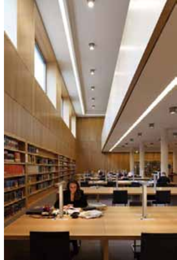
University Frankfurt am Main, Campus Westend

The interior of the Law and Economics faculty library on the Westend Campus has been designed just as sharply as its facade. The veneered surfaces of the furnishings form an exciting contrast to the stone outer shell.