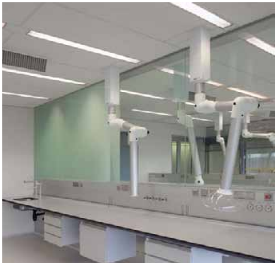
NFI, Den Haag (NL) – Special laboratory walls, a media supply system, electrical supply and the laboratory furniture were provided by Lindner for this project.