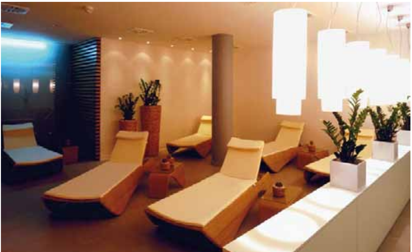
Illustrations on this page: Hotel Ininside, Frankfurt am Main

Inside Hotel in Frankfurt: Lindner carried out the demolition work, scaffolding and masonry work, steel construction work, concrete and reinforced concrete work, decorative plaster work, the entire dry wall construction and the facade construction. In addition, Lindner supplied and installed the wood doors and partition walls.