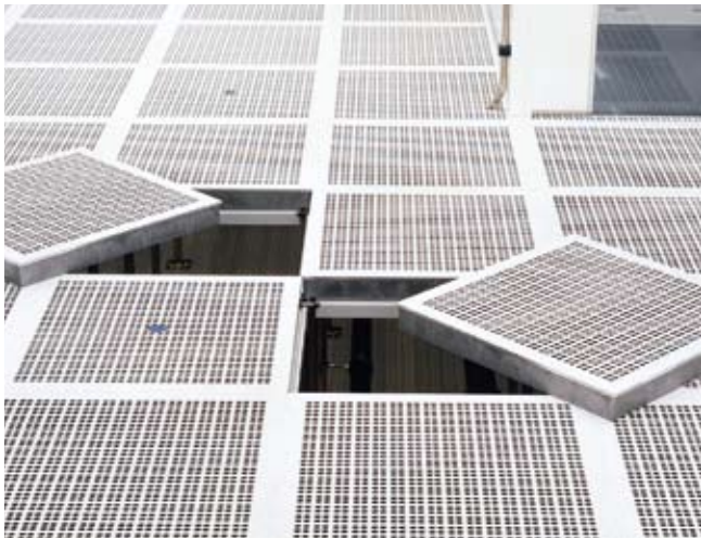
Technical University, Dresden