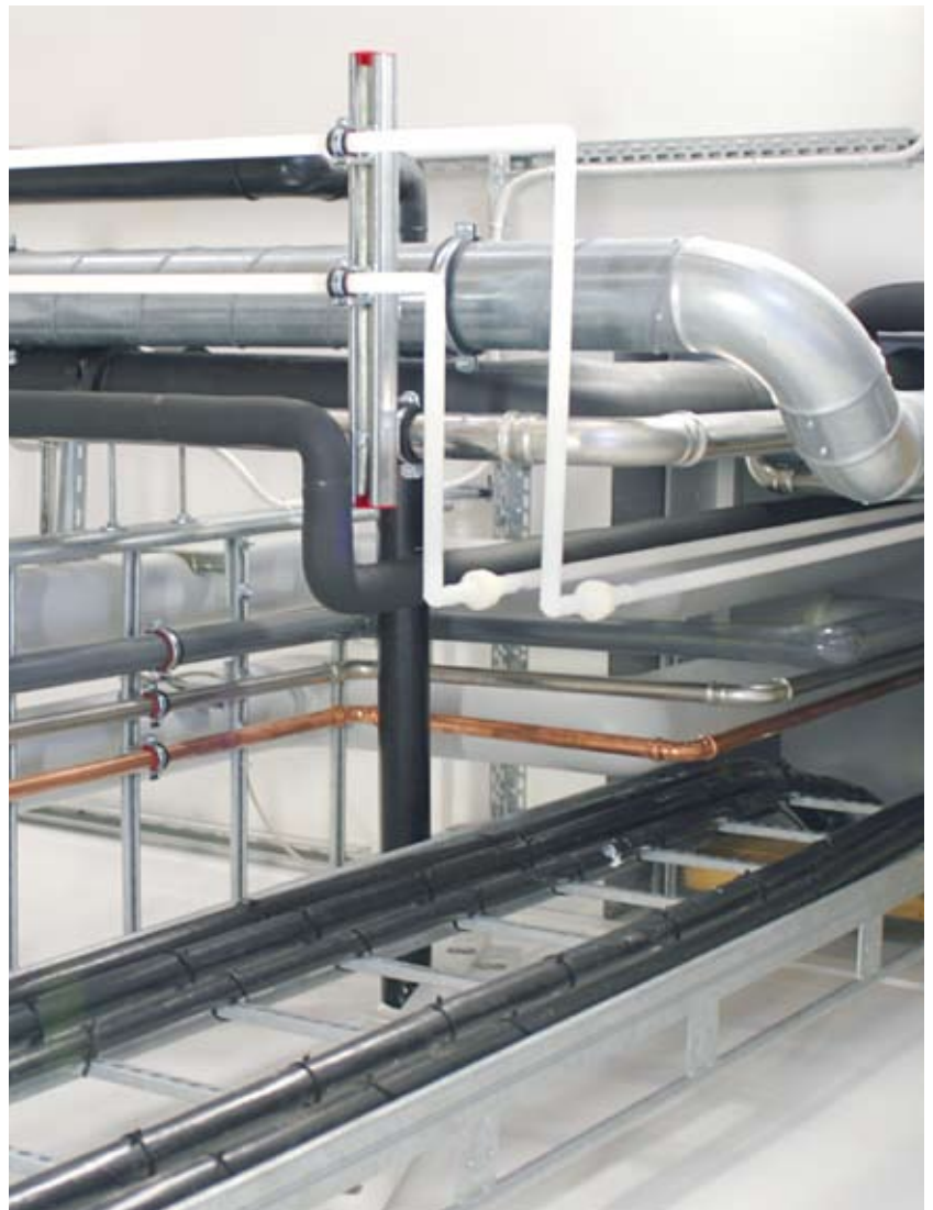
Leine & Linde, Strängnäs, Sweden