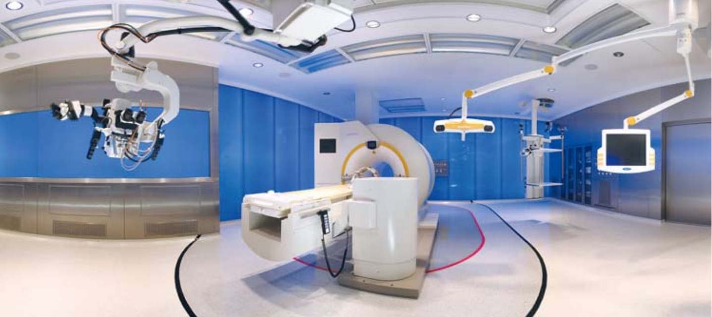
BrainSUITE, King Fahad Medical Centre, Riyadh