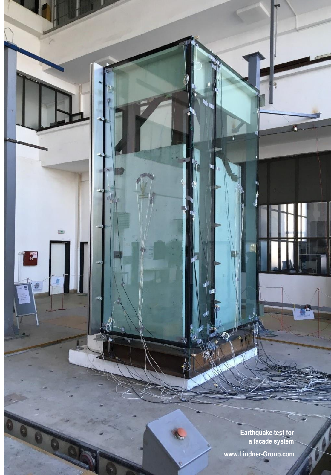
Earthquake test for a facade system www.Lindner-Group.com

project-specific adaptation to aesthetic and functional requirements