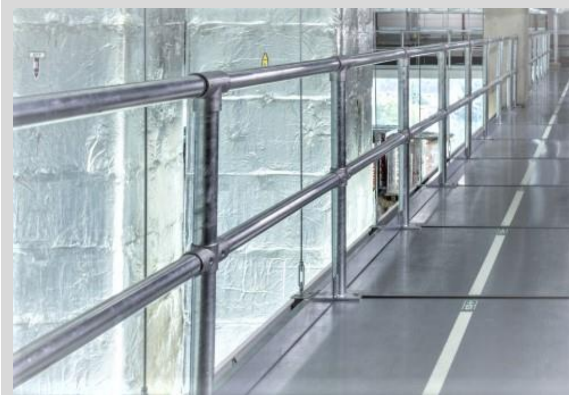
Image 1 Railing for walkable ceiling systems