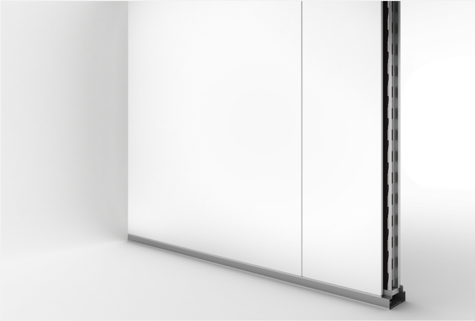
Partition system Multiclean LVT