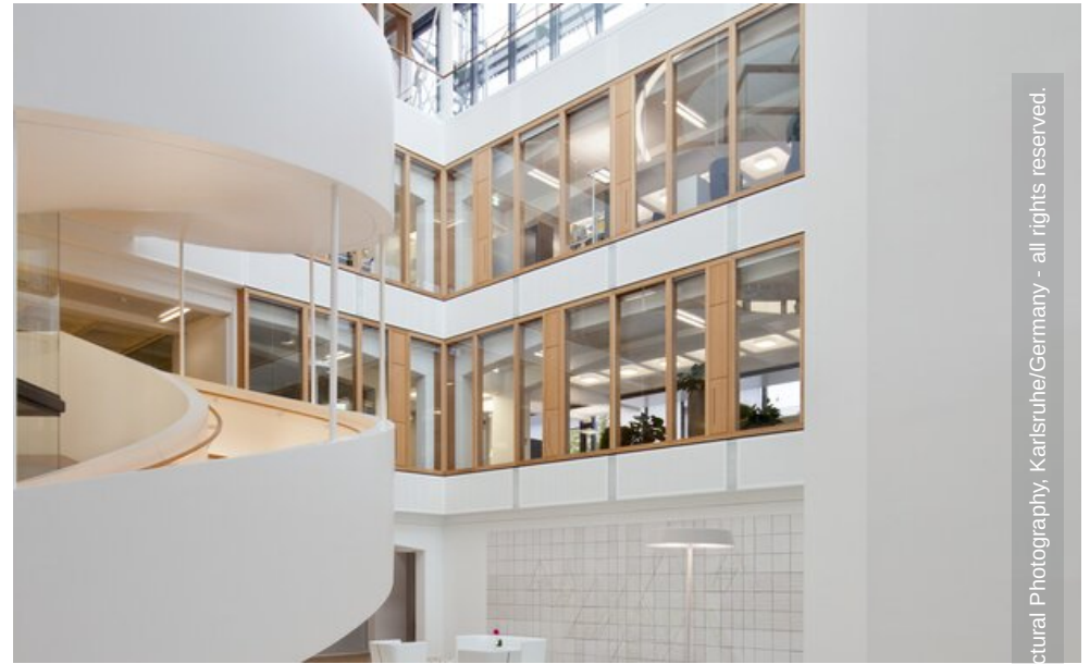
er. Architectural Photography, Karlsruhe/Germany - all rights reserved.