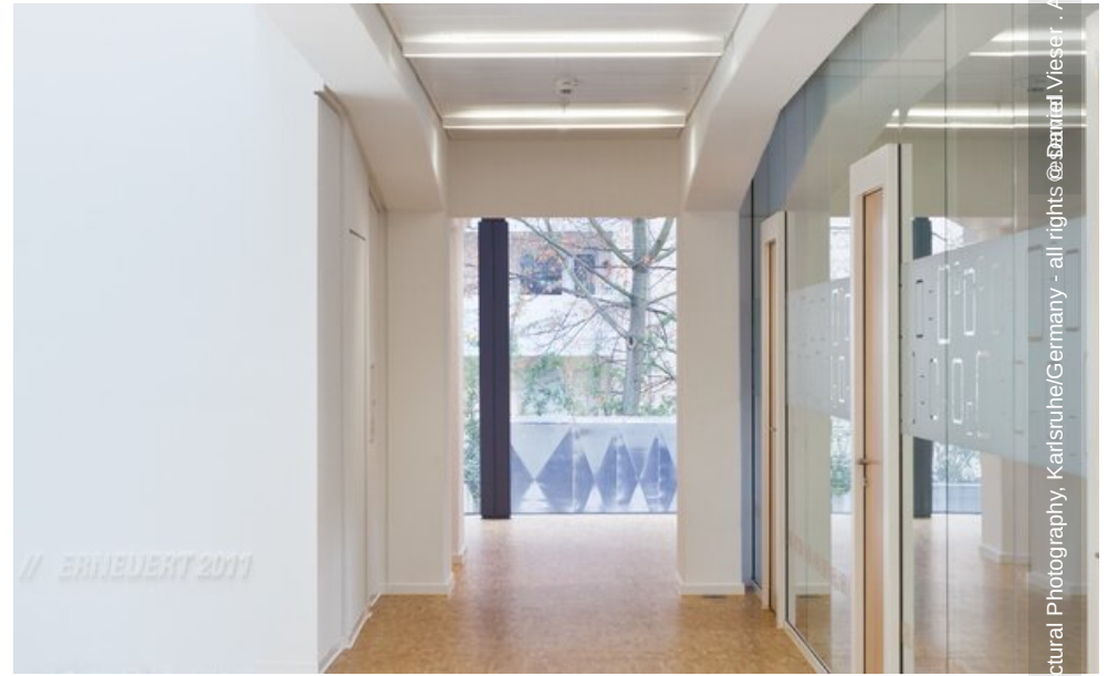
er. Architectural Photography, Karlsruhe/Germany - all rights reserved.