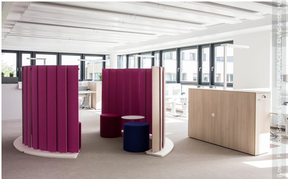
Hamburg