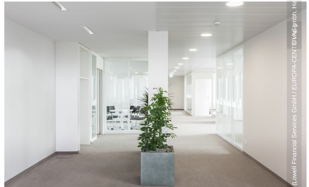
Hamburg