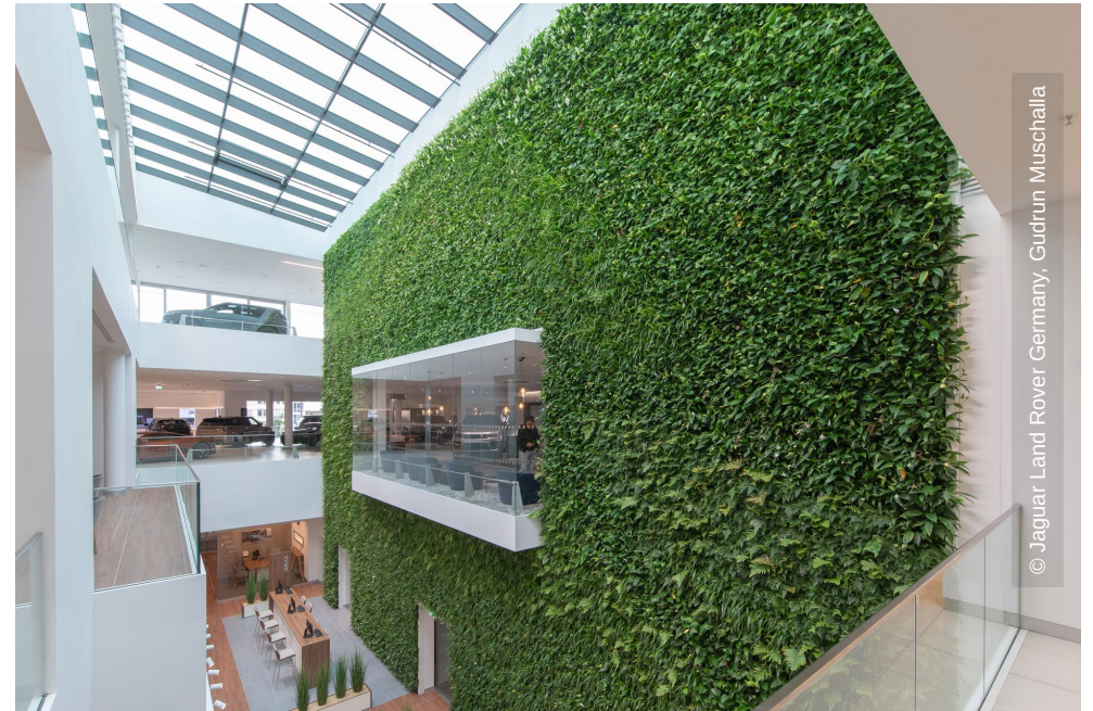
© Jaguar Land Rover Germany, Gudrun Muschalla