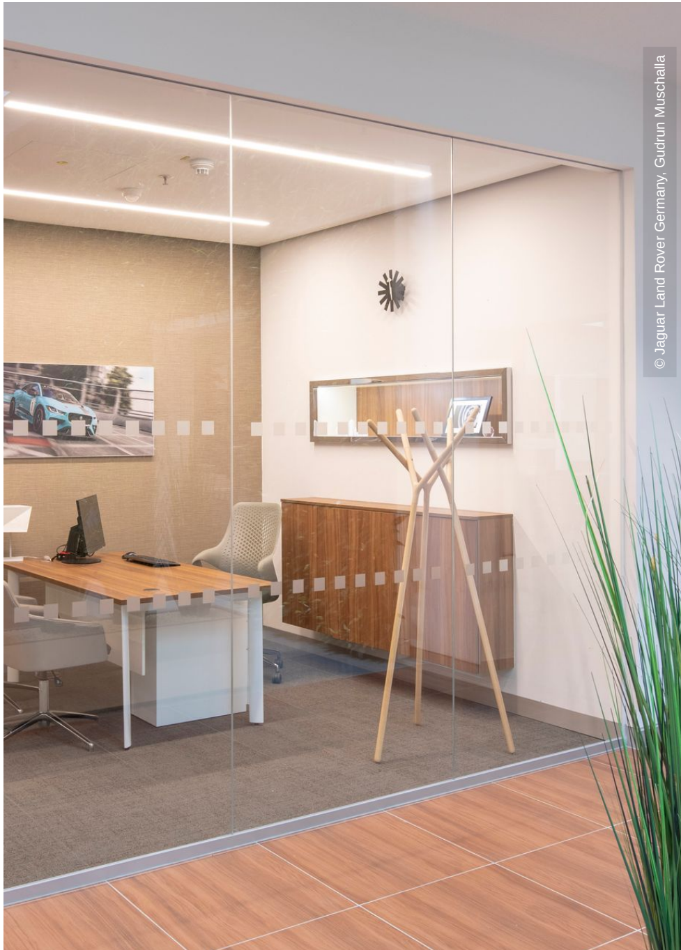
© Jaguar Land Rover Germany, Gudrun Muschalla