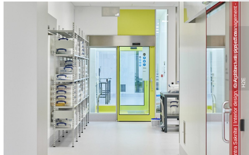
nt - arch. Antra Saknīte | Interior design, navigation – design office H2E