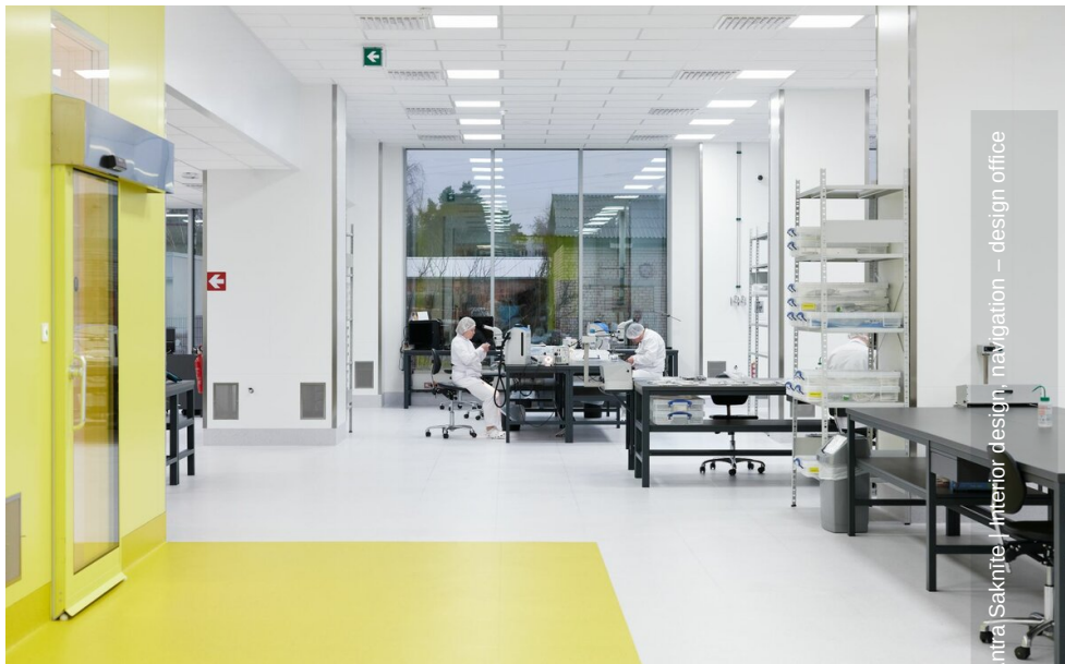
nt - arch. Antra Saknīte | Interior design, navigation – design office