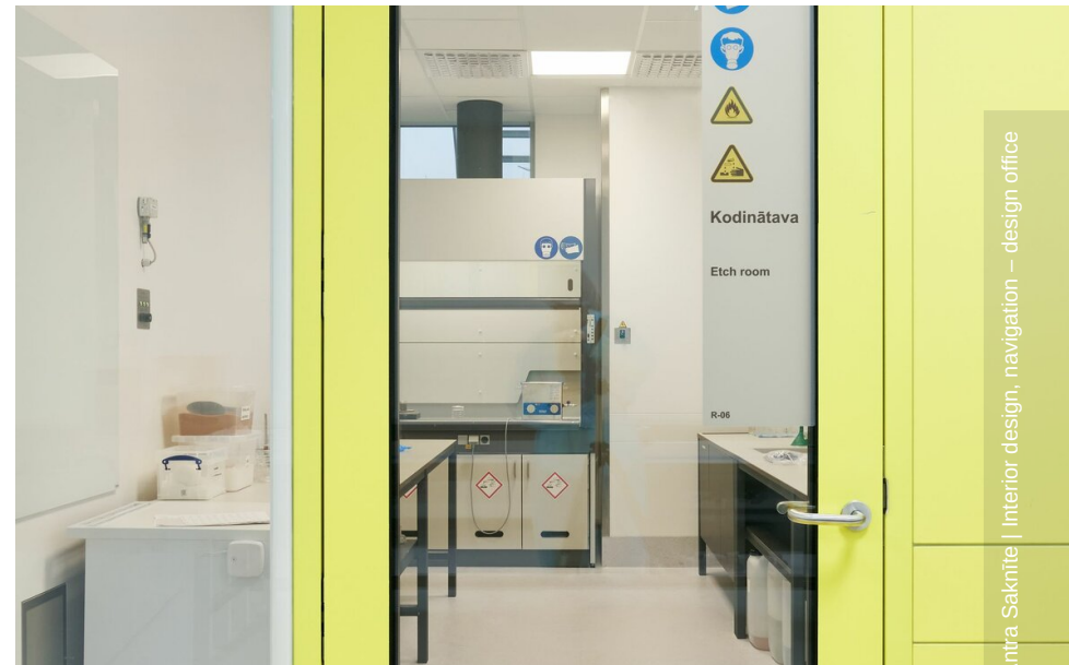
nt - arch. Antra Saknīte | Interior design, navigation – design office